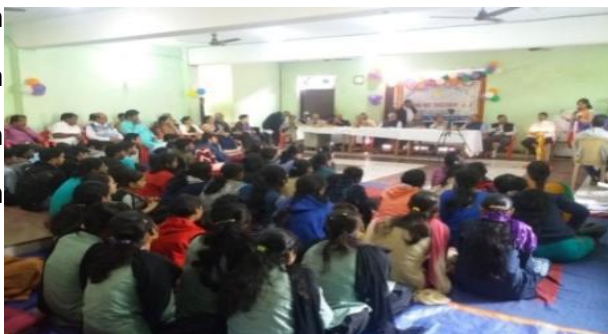
(NSF and Vikash scholarship cheque distribution for a group of nursing students)

Through the support of North South Foundation (NSF), an event of scholarship cheque distribution was held at Vikash Educational Charitable Trust in which 138 students received their cheque from invited dignitaries.